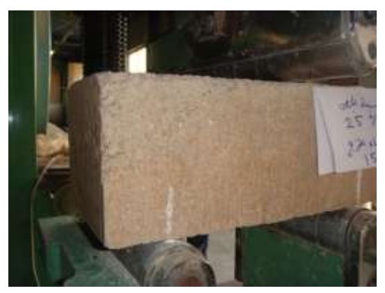
Fig.7 Flexural test used in this work