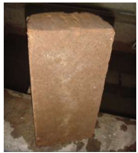
Fig.8 After absorption test used in this work