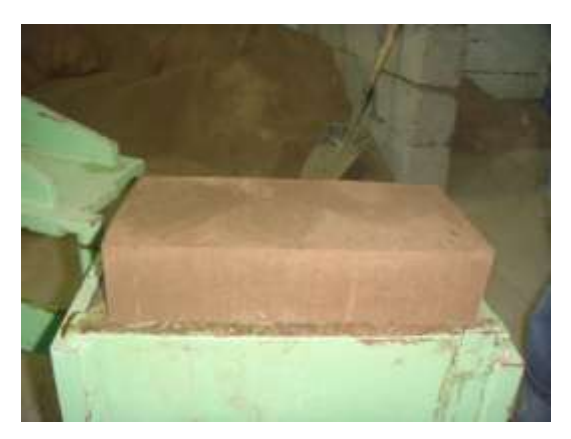
Fig.5 Demoulding of CEB from the CINVApress